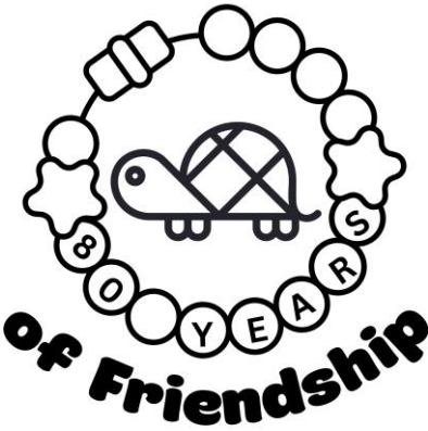
Big Playdate 2025 Aldrich School

Aldrich's annual fundraiser, The Big Playdate , will be here before we know it!