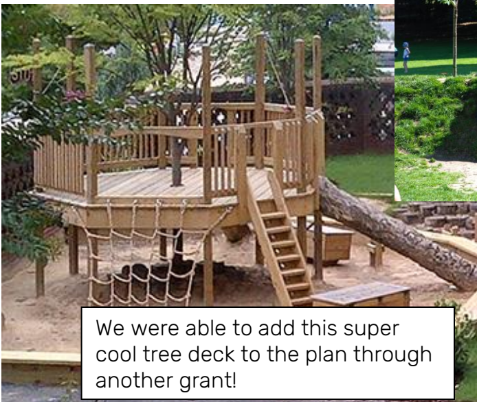
We were able to add this super cool tree deck to the plan through another grant!